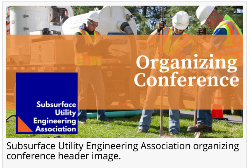
Subsurface Utility Engineering Association organizing conference header image.