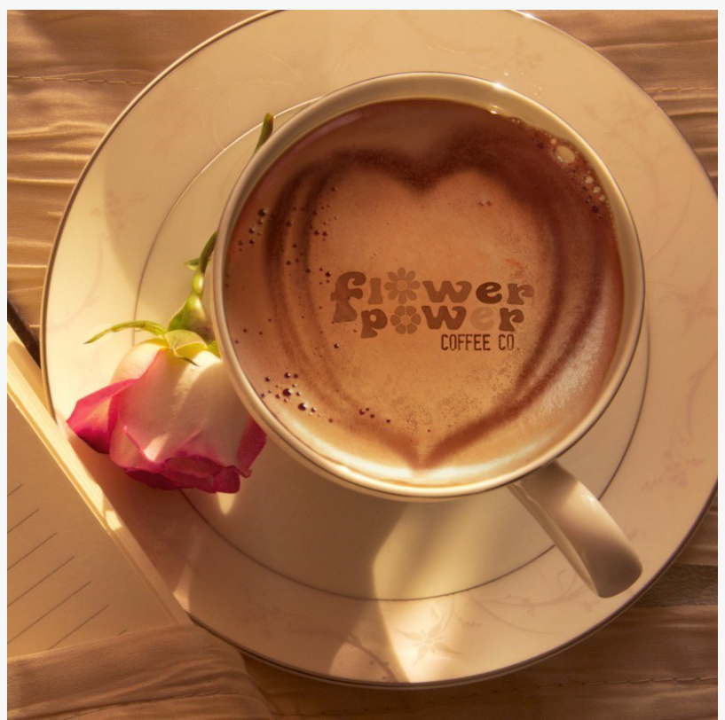
Flower Power Coffee

Owners John P. Greco III & brother Tommy Greco are delighted to EXCLUSIVELY serve Flower Power CBD Coffee at both restaurants in New York City. The Costa Rican blend served is full-bodied with a good balance and lively acidity. Flower Power's CBD coffee is derived from hemp and, according to a recent story in Bon Appetit magazine, is double-tested in a lab in Massachusetts to ensure it is THC-free.