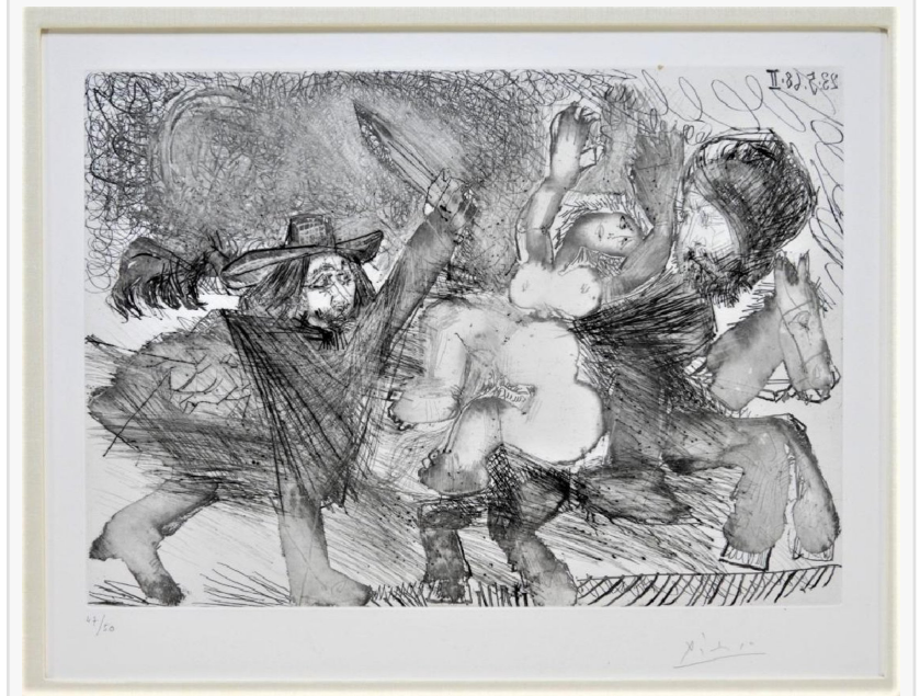
Picasso etching titled Suite 347 No. 106, #47 of 50, signed and numbered (est. $3,000-$5,000).