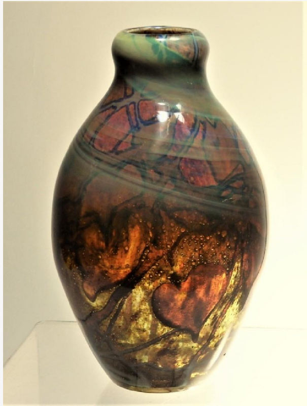
Tiffany Studios circa 1910 paperweight Favrile glass vase, 10 inches tall (est. $15,000-$20,000).

The first is a 26-foot-wide ink and watercolor depiction of three cliffside landscape scenes of robed scholars by the Chinese artist and poet Gai Qi (Chinese, 1773-1828). The Qing dynasty scroll is a masterpiece and museum-quality, signed throughout with calligraphy red seal chop marks. Gai Qi painted in Shanghai and was associated with Fei Dangxu (Chinese, 1801-1850).