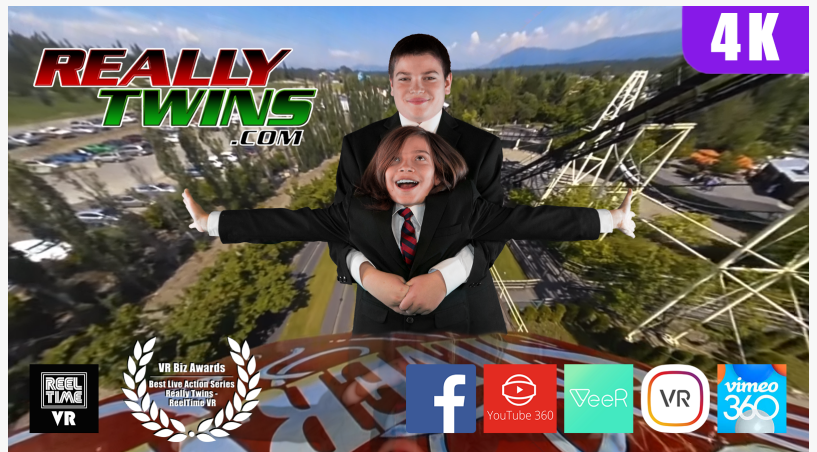
Really Twins Coaster Thumb