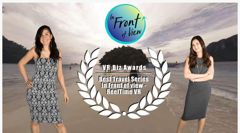
front montgomery vr biz award