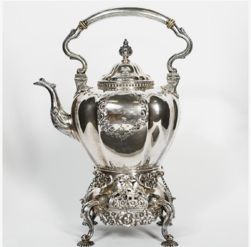
Circa 1840s Georgia coin silver kettle on a stand, crafted by Clark, Rackett & Co. (est. $4,000-$6,000).