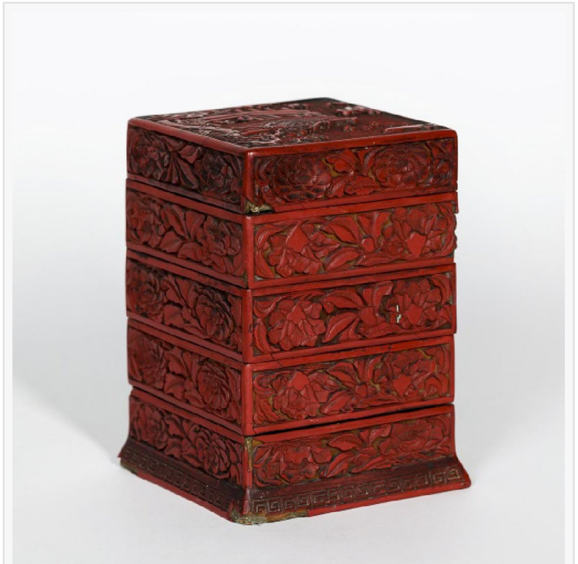
Chinese 17th century cinnabar lacquer five-tiered box and cover of square form (est. $4,000-$6,000).

Elizabeth Rickenbaker Ahlers & Ogletree Auction Gallery (404) 869-2478 email us here