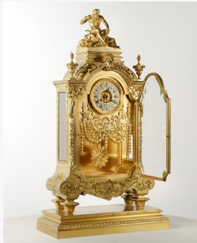
French ormolu gilt mantel clock by Barbedienne, surmounted by a figure of Neptune (est. $15,000-$25,000).