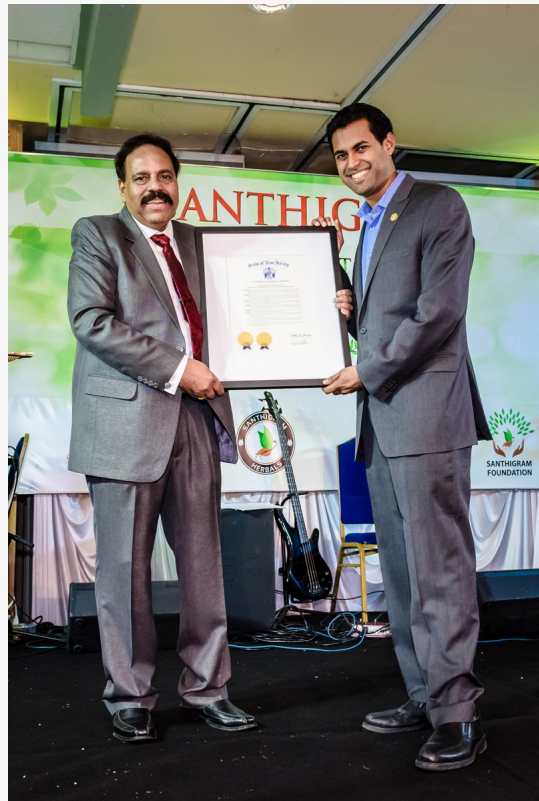
State of New Jersey honors Santhigram for its excellent healthcare services