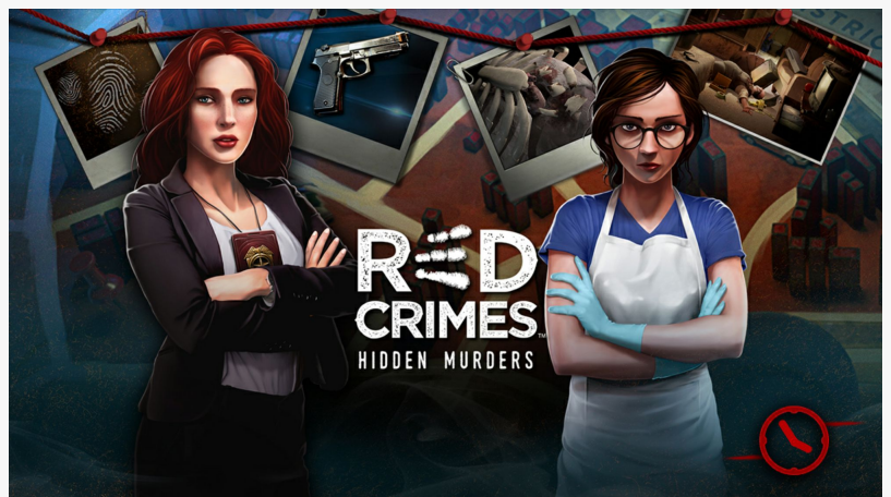
Play Red Crimes: Hidden Murders

Red Crimes: Hidden Murders is a F2P mobile game with console quality real time graphics. Set in a realistic '90s scenario, it features a dark and gripping storyline, taking the player on a journey to track down and solve the most insidious crimes.