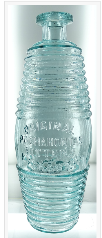
Original Pocahontas bitters bottle, aqua in color, graded a 9.8

Jeff Wichmann American Bottle Auctions (800) 806-7722 email us here