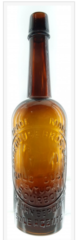
Gold Dust Barkhouse Brothers Kentucky Bourbon bottle, with a mint grade of 9.5.