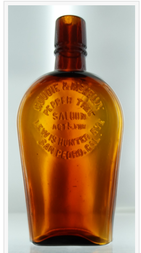
Goudie & McKeley Peppertree Saloon (San Pedro, Calif.) coffin-shaped amber Western flask, graded 9.9.

American Bottle Auctions is always accepting quality consignments for future sales. To consign a