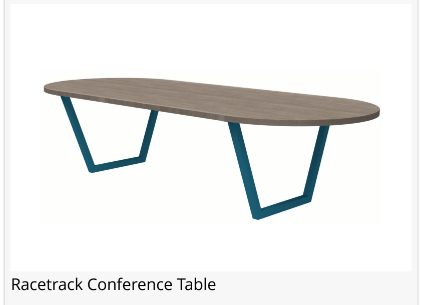
Racetrack Conference Table