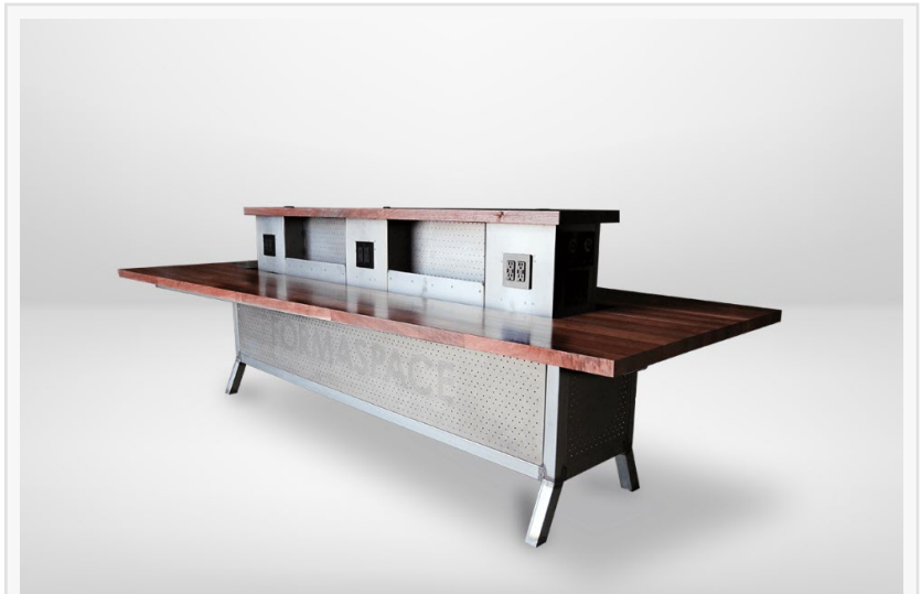
Custom Conference Table

The New Weldmarx CIII trapezoidal conference table is ideal for making presentations to a group, thanks to its unique shape. Shown here is the custom version we built for display at the NeoCon 2017 contract furniture show.