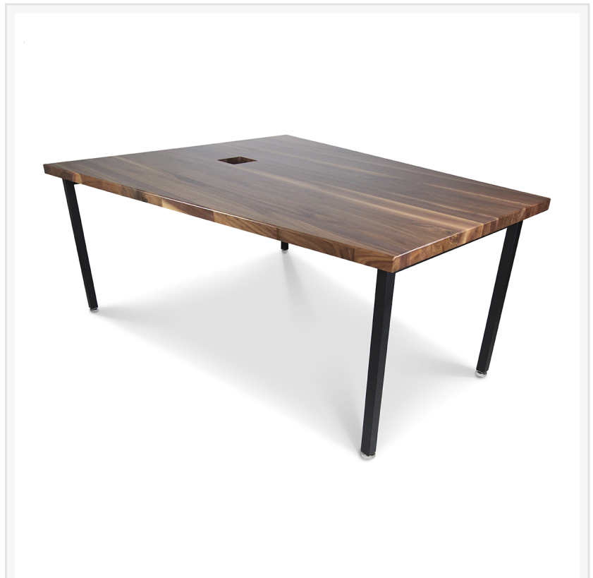
Trapezoid Conference Table

* Large rectangular conference tables make a good fit for the larger conference rooms. To maintain order during formal meetings, it's best to specify a table that's at least 4-foot across to reduce the tendency of participants to lose focus by interacting with those seated directly across