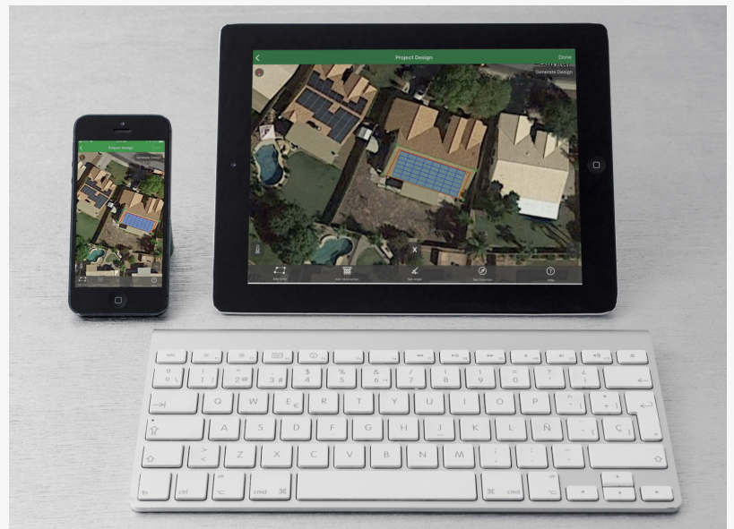
Available and free to download on the App Store for iOS devices, coming soon to android