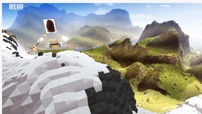
screenshot Tutorial 12 Magic Bowt