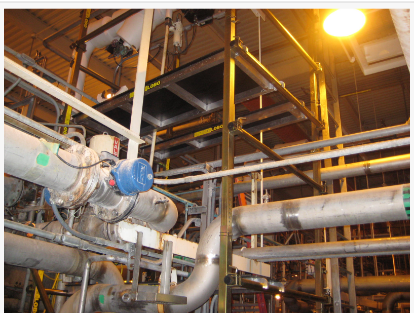
Awkward Access made easy

Designed specifically for LOBO's advanced work platform system, it is fitted with feet for easy pallet truck or fork lift manoeuvrability. Also, it can be locked with a padlock for security or storage. The Towerstore can be vertically or horizontally mounted to suit the workshop or can be transported for