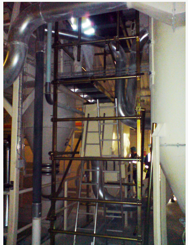
Awkward Access made easy

The LOBO System, utilising its unique patented clamp, can be reconfigured and adjusted, without the need for tools, into any shape or size required. This simple system can be assembled by anyone, as the components are modular. LOBO's electroplated steel legs and components can be flat packed when not in use and transported easily, for storage or utilisation elsewhere.