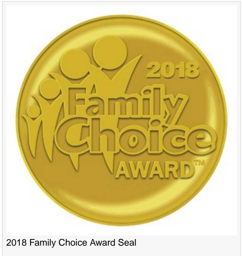
2018 Family Choice Award Seal

The Family Choice Awards recognize the best in children's and parenting products. Now in its 22nd year, the Family Choice Awards is one of the most coveted, family-friendly consumer award programs in the nation. Receiving this award serves as a recommendation from Family Choice to families and grants MyPhonePouch, LLC permission to proudly display the award logo on their website, marketing materials, packaging, social media and any other medium. MyPhonePouch will also be featured in the 2018 Family Choice Summer Gift Guide.