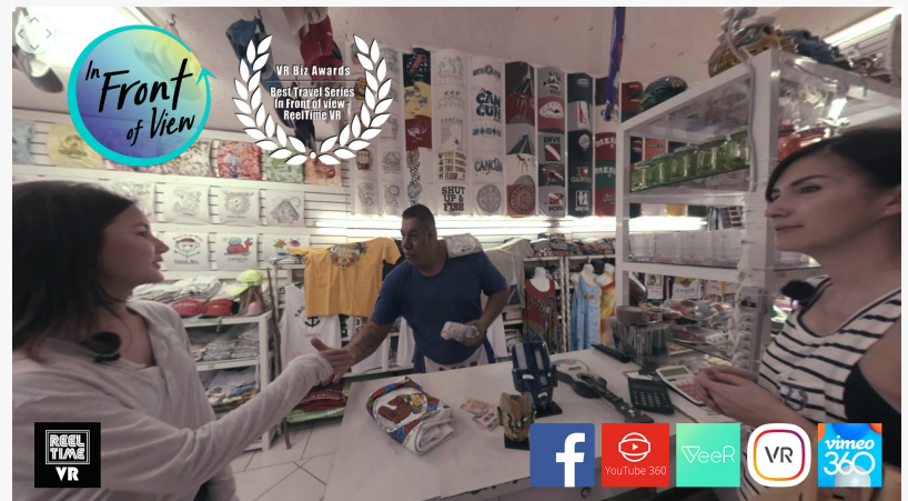
In Front Of View Market thumb