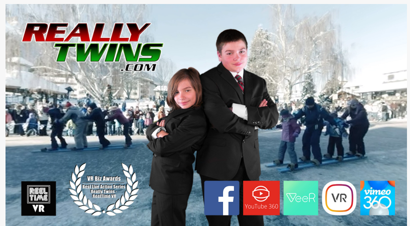
ReallyTwins Icefest Thumb