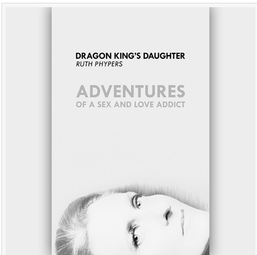
Audio Book Cover: Dragon King's Daughter