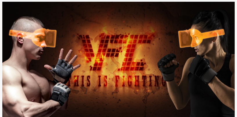
This is Fighting - Test your mettle in a virtual fist fight

Virtual Fighting Championship (VFC) is a VR PvP fighting game - Featuring a true to life virtual caging fighting experience. The game will allow its players to put on a true display of fighting skills: Jabs, hooks, crossovers, dempsey roll... you name it, all your favourite fighting moves can now be extravagantly unleashed inside the virtual arena against a REAL PLAYER to test your mettle.