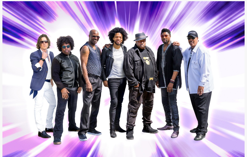
Playing with the excellence Prince always expected

The non-profit organization formed in 2017, comprised of former employees of Paisley Park and Prince. The group's mission is to continue the generosity of their late employer who supported opportunities for underprivileged youth to grow in music, tech, arts and education, and help alumni