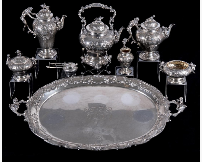
German silver tea and coffee service by J.D. Schlessinger Sohne, Hanau, circa 1900-1920 (est. $8,000-$10,000).

To learn more about Gray's Auctioneers & Appraisers and the live and internet auction planned for Wednesday, July 11th, at 11 am, visit www.graysauctioneers.com . Updates are posted often.