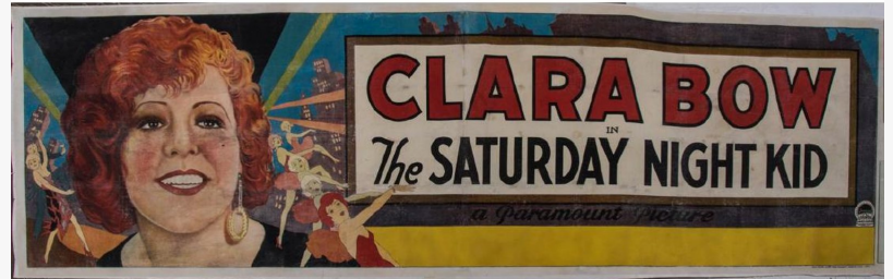
Rare, linen-backed movie banner for the early talkie The Saturday Night Kid from 1929, starring Clara Bow (est. $6,000-$8,000).

Lot 27a is a fantastical untitled welded steel sculpture by an unknown artist, somewhat akin to a tree that has been twisted and curled around itself to a point of sublime abstraction. It's nature rendered into the mechanical. The 20th century creation, standing 64 inches tall by 58 inches wide and 28