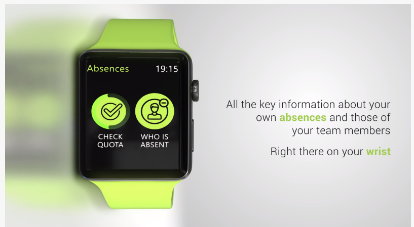
Every key information about your absence and those of your employees is effortlessly available on your wrist.