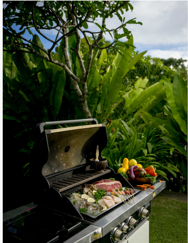
In Villa BBQ display in the villa

Prhativi Dyah The Ritz-Carlton, Bali +(62)361 849 8988 email us here