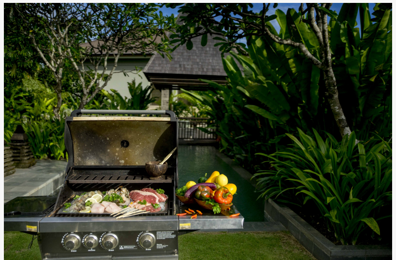
Intimate BBQ display private pool

This press release can be viewed online at: http://www.einpresswire.com