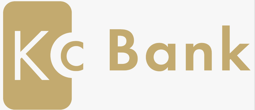
KC Bank Logo

KC Bank is going to be revolutionizing the way in which cryptocurrencies are handled. They have been given the green light for operations beginning in just two days. Thus, things are about to change