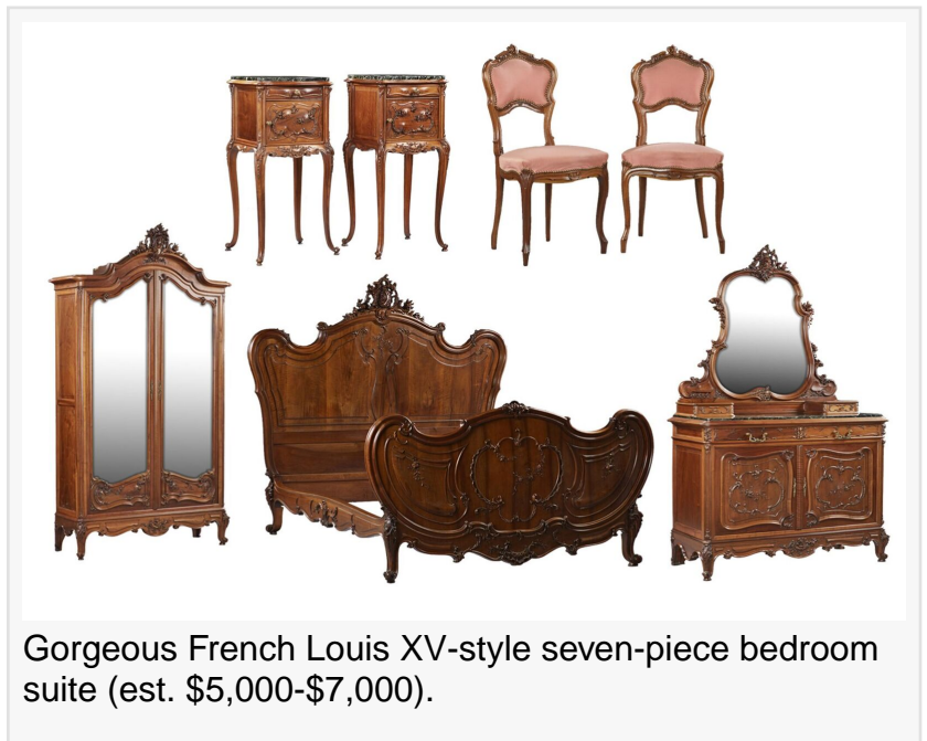
Gorgeous French Louis XV-style seven-piece bedroom suite (est. $5,000-$7,000).

NEW ORLEANS, LA., UNITED STATES, July 3, 2018 /EINPresswire.com/ -- NEW ORLEANS, La. – An exceptional early 20th century French Louis XV-style carved walnut seven-piece bedroom suite, beautiful early 20th century Russian icons and original oil paintings by Marie Madeleine Seebold Molinary (New Orleans, 1886-1948) and Clarence Millet (La., 1897-1959) will headline Crescent City Auction Gallery's next big sale planned for July 21-22.