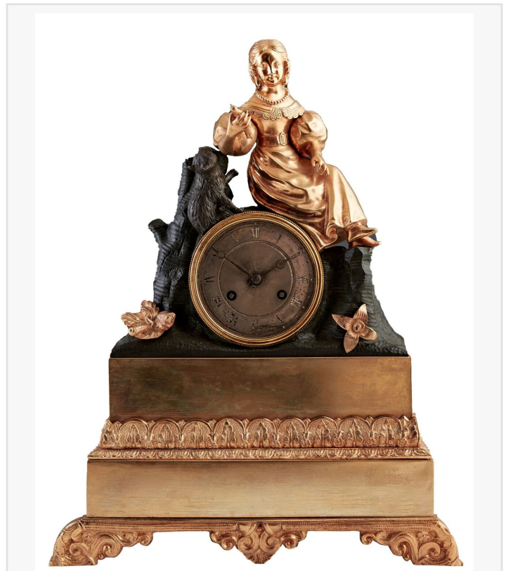
Louis XV-style gilt and patinated bronze figural mantel clock, made circa 1850 (est. $700-$1,000).

Also from France is a Louis XVI-style ormolu