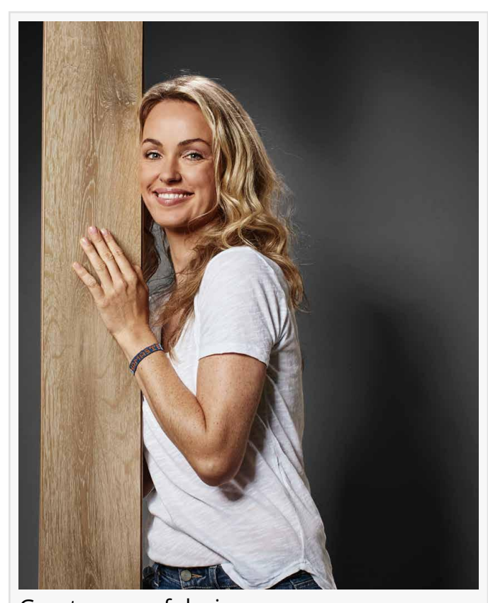
Great range of designs

The 'Made in Germany' tag has always served as a first-class quality promise that's acknowledged worldwide. All ter Hürne laminates are crafted in