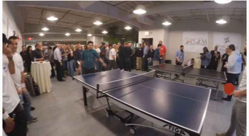
Lauletta Birnbaum Ping Pong Tournament