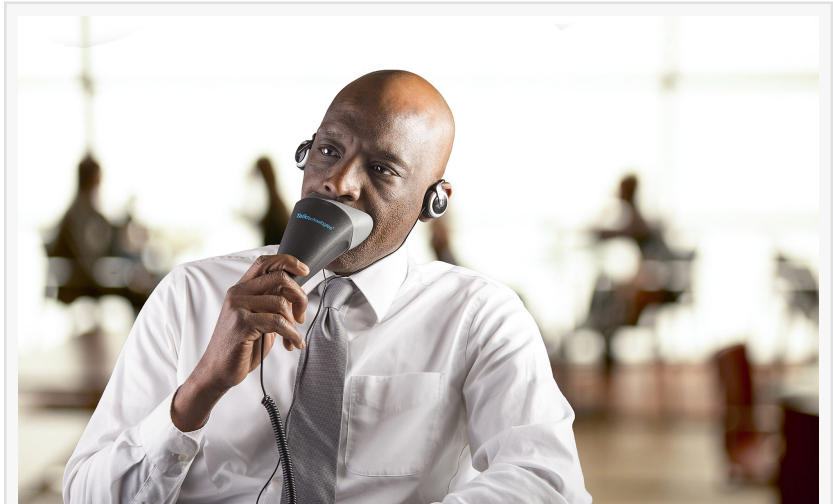
Industry best noise cancelling, speech recognition microphone