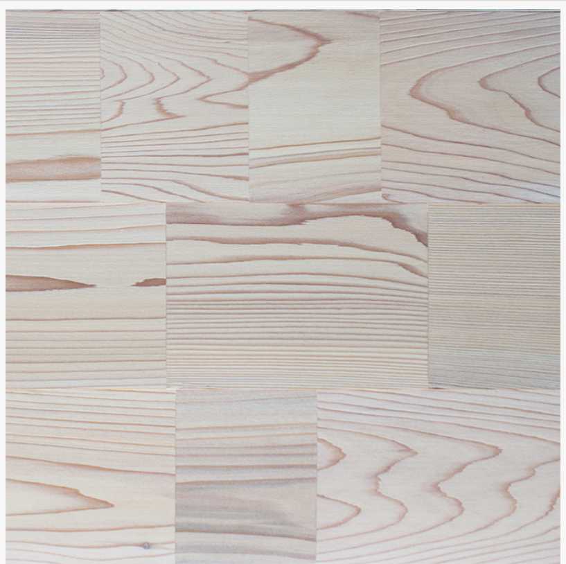
DIAMANT western red cedar

Using only Clear A&Better Mixed Grain Western Red Cedar, "blocks" ranging in lengths from 3" to 11" are finger jointed together to create consistent plank dimensions of 1 1/16" thick X 7-1/4" wide X ALL 16' Long. Finger jointing is a woodworking joint made by cutting a set of complementary rectangular cuts in two pieces of wood, which are then glued, with a high quality PUR adhesive. To visualize a finger joint simply interlock the fingers of your hands at a ninety degree angle; hence the name "finger joint". The "blocks" are recovered from trim backs (typically a very high quality waste product) from various parts of the production process of milling WRC into traditional products. The planks maintain the superior durability characteristics of Western Red Cedar and