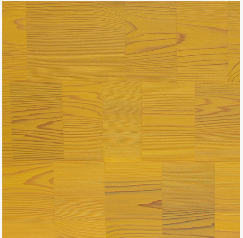
VILLA SAVOYE western red cedar

This press release can be viewed online at: http://www.einpresswire.com