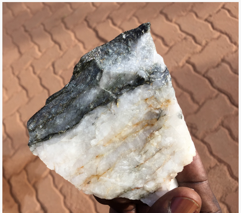
Gold in quartz from Niangouela

The 38-square km Bouboulou project comprises no less than five established gold zones contained within three separate 5-km long gold