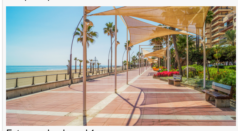
Estepona boulavard 1