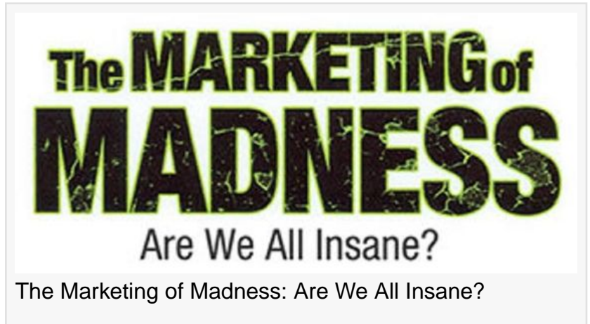
The Marketing of Madness: Are We All Insane?

exposes shocking ethical issues in the mental health world today, and traces these back to their origins. The film will be shown at the CCHR center in Clearwater at 109 Ft. Harrison Avenue on July 25th, at 6:30. Admission is free.