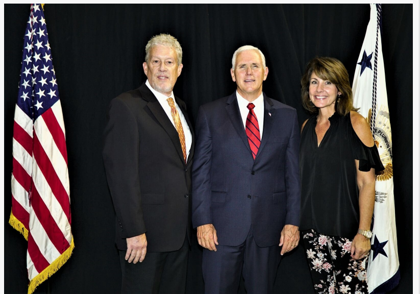
With Vice President Pence

*That July 4th, 1776 is not America's actual Independence day. And about the drunken party that occurred on the real day. So were America's Founding Fathers plastered when they declared America's Independence from England? You'll find out in the pages of UNKNOWN AMERICA.