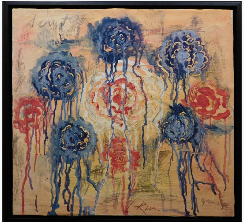
Untitled (Avatar) oil on canvas painting done in the manner of Cy Twombly (est. $8,000-$12,000).