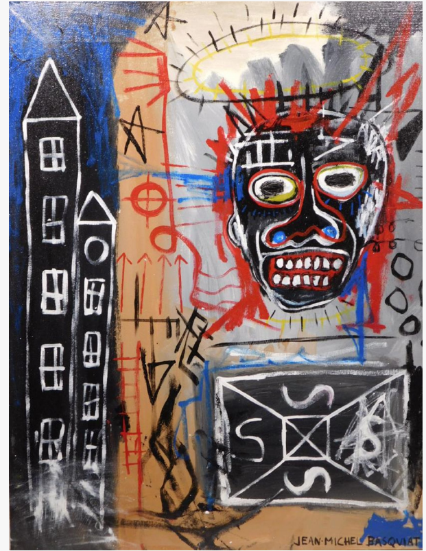
Untitled oil on canvas painting done in the manner of Jean-Michel Basquiat (est. $20,000-$30,000).

An unsigned, framed oil on canvas from the School of Hilma af Klint (Swedish, 1862-1944), one of the earliest abstract expressionists, 22 ¼ inches by 19 ½ inches in the frame, has an estimate of $5,000-$8,000. Also, an oil on paper executed in the manner of