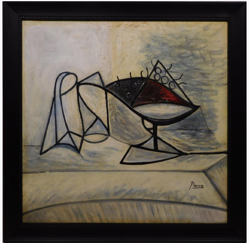
Oil on canvas work titled Cubist Still Life attributed to Pablo Picasso (est. $15,000-$25,000).