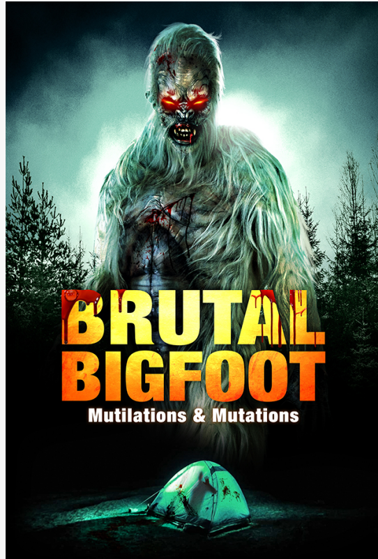
First of Five

The Searching for Bigfoot expedition team is gearing up for the fall expedition, we are in the process of collecting eye witness accounts as well as pictorial, and physical evidence to plan our next exploration route across the United States. Go to the searchingforbigfoot.com website for instructions on reporting your encounters. You could be one of the lucky ones that the team meets, investigates with and shares information with. Be rewarded with your very own Searching for Bigfoot merchandise for your contribution to the research of the mysterious creature known as Bigfoot.