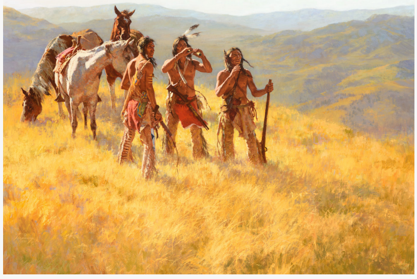
Howard Terpning, Dust of Many Pony Soldiers, 1981 (est. $800,000-$1.2 million)

Medal award winner in the 1981 Cowboy Artists of America Show. The oil embodies the technical skill and spirit that collectors of Fine Western & American Art look for. The most important element to be noted is the artist's ability to capture a "moment to moment" feeling where the viewer and the subjects seem to be experiencing the immediate action together. Panoramic depictions of canyons, golden prairies and majestic mountainsides are met with an assortment of characters that navigate the classic American landscape through a variety of candid narratives. Masterfully painted night scenes, depicting moonlit ancestral teachings, are saturated in the same enchanting reality as the rugged bronzes that capture the fury of a bucking horse or a Trapper's dangerous downward descent.