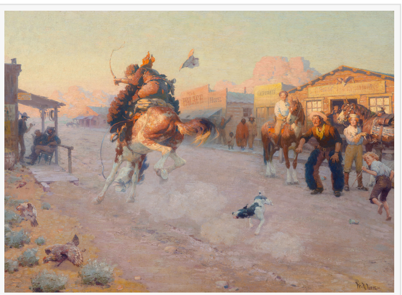
William Leigh, Embarrassed (Range Pony in Town), circa 1910 (est. $1 million-$1.5 million).

Blue-chip contemporary artists that make up a large portion of the sale will be headlined by Howard Terpning's, Dust of Many Pony Soldiers, a Gold