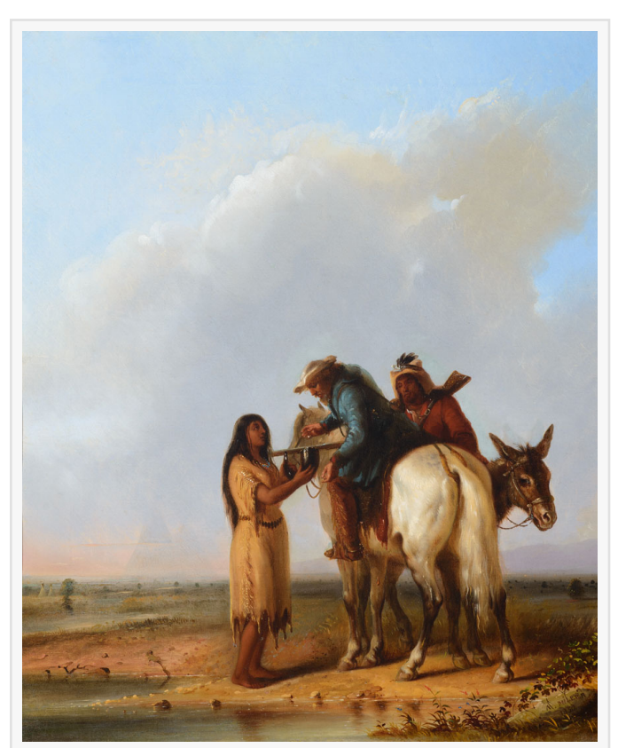
Alfred Jacob Miller, The Thirsty Trapper, 1850 (est. $1.5 million-$2.5 million).

Bidsquare, the exclusive online bidding platform for The Coeur d'Alene Art Auction for the fourth consecutive year, is prepared to get back in the saddle on auction day. After generating over $6 million in bids placed during the live sale in 2017, and totaling over $1 million in online sales, Bidsquare has become a reliable spur in boot heel of the most important event for collectors of Western art. Conveniently, the online buyers premium is the same as the floor bidders premium, an aspect that loosens the reigns and