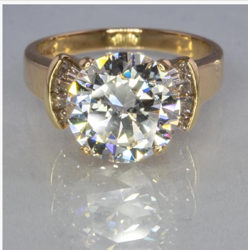
14kt yellow gold and diamond ring, set with a diamond weighing about 2.96 carats (est. $18,000-$20,000).

Bidders will be presented with 295 lots of fine art, furniture, decorative arts, rugs, jewelry, dolls and more, beginning at 11 am Eastern time. For those unable to attend in person, online bidding will be available through the Gray's Auctioneers website, at GraysAuctioneers.com , and at LiveAuctioneers.com and Invaluable.com . Telephone and absentee bids will also be accepted.