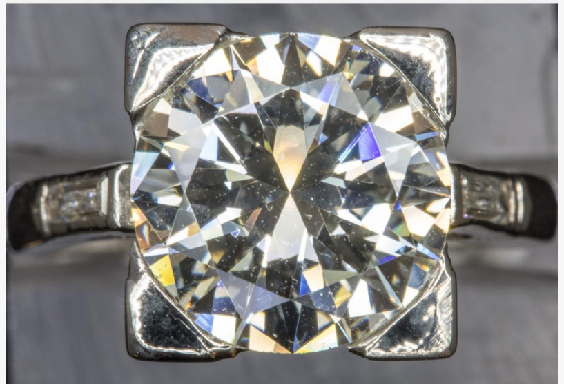
Platinum and diamond ring set with a round brilliant cut diamond weighing about 2.86 carats (est. $16,000-$18,000).