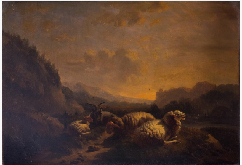
Original landscape oil painting by Balthazar Paul Ommeganck (Flemish, 1755-1826) (est. $2,000-$4,000).

Gray's Auctioneers are northern Ohio's leading licensed auctioneers and appraisers of fine art, antiques, decorative arts, rare books, fine jewelry and antique rugs. The boutique auction house has over two decades of experience in the art business. Experts at Gray's offer traditional real estate services and specialists there have