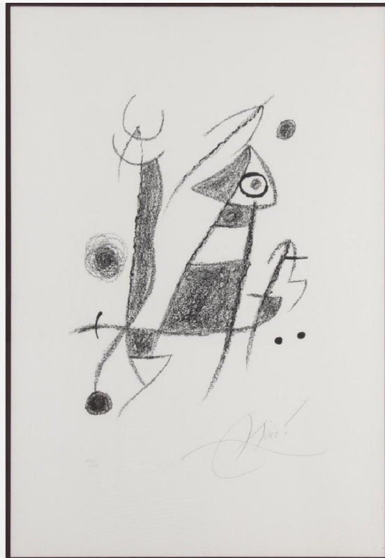
Black and white lithograph signed and numbered (XIV/XV) by Joan Miro (Sp., 1893-1983) (est. $3,000-$5,000).