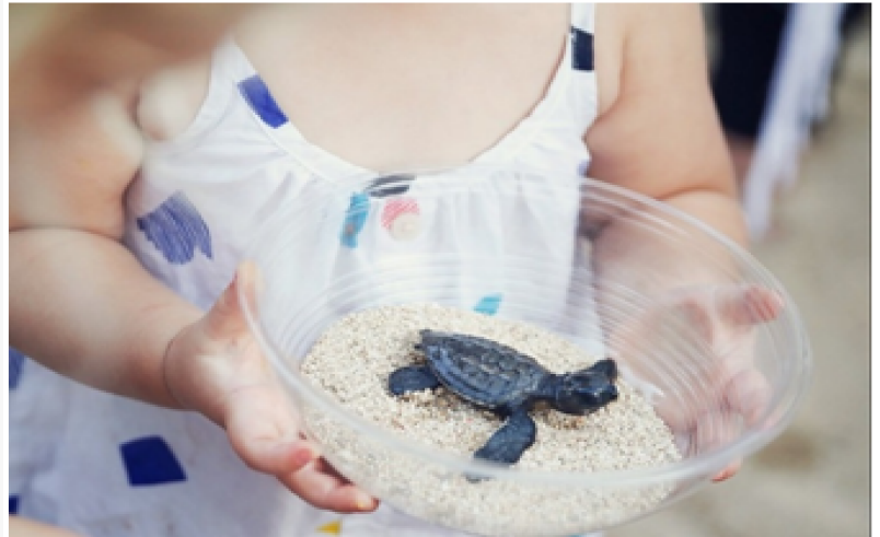
Baby sea turtle is ready to be released in the ocean

Turtle Release events are particularly popular with the resort's younger guests and a buzz of excitement infuses Ritz Kids Club during hatch season, with turtle themed decorations and the opportunity to learn about the importance of protecting sea turtles and the environment. Helping to save a life by being an active participant in the turtle release is a memory they will never forget.