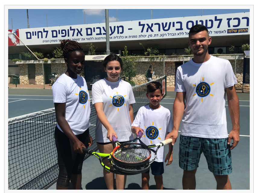
ITC August 2018 Student Exhibition team

The team and their coach represent various Israel Tennis Centers across Israel. During their appearances in Canada and the US, in addition to playing tennis, they will share their personal stories about what the ITC has meant to them, their families and the communities in which they live.