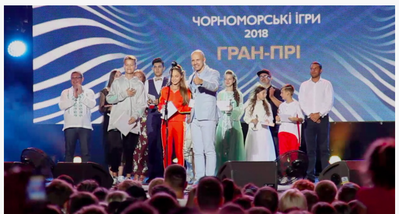
Burisma Group supports Ukraine's largest kids festival "Chornomorski Games"

KYIV, KYIV, UKRAINE, August 1, 2018 /EINPresswire.com/ -- The International Energy Group Burisma became a patron of the XVI All-Ukrainian charitable kids' festival " Chornomorski Games ". This year's vocal contest received over 500 participants from all over the country. Fifty of them, the strongest vocalists, competed for the main prize at the sea-front in Skadovsk.