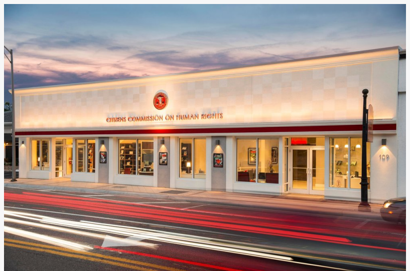
The headquarters for CCHR Florida are located in downtown Clearwater

A special event is scheduled to commemorate members of the U.S. military and veterans for the 3rd anniversary of Purple Heart Day, which is observed annually on August 7th to honor those who have been awarded the Purple Heart medal for their service.