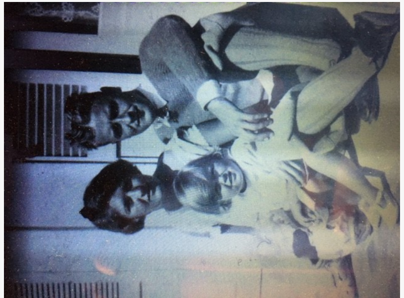
Zelda, Scott, and "Scottie" Fitzgerald

This press release can be viewed online at: http://www.einpresswire.com