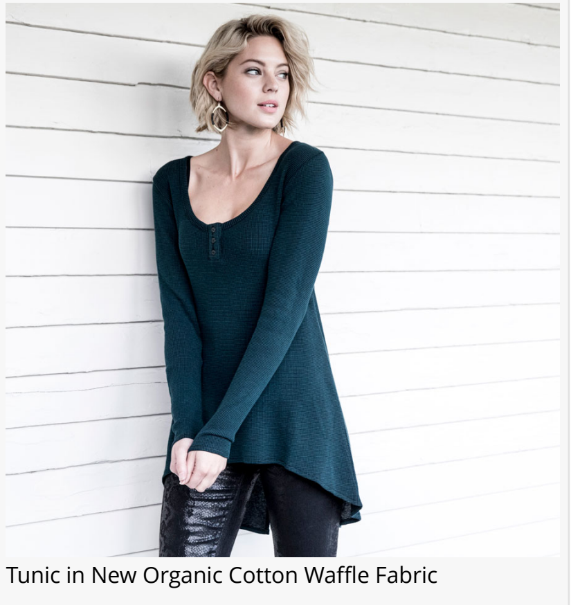
Tunic in New Organic Cotton Waffle Fabric