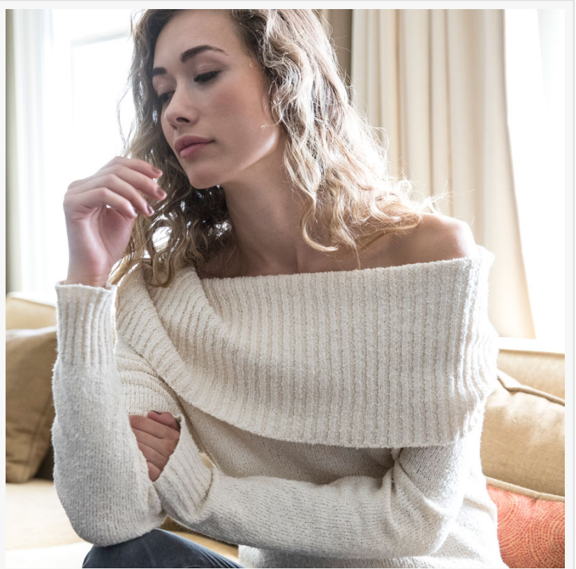
Artisan Handcrafted Bardot Pullover Sweater