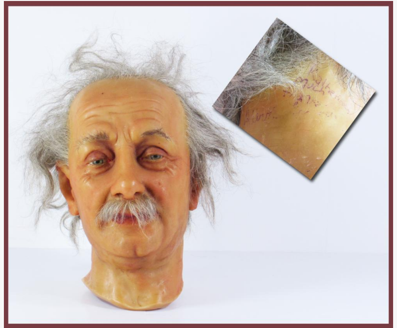
Rare life-size wax mold of Albert Einstein's head, with human hair, signed by him (est. $15,000-$20,000).