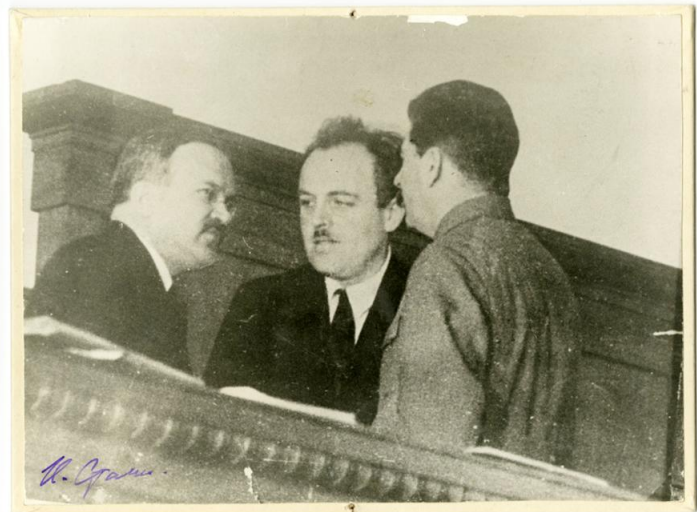
Reproduction photo print signed by former Russian leader Joseph Stalin, taken in 1930 (est. $15,000-$20,000).