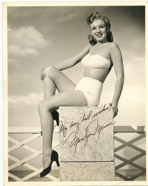
Finest known early Marilyn Monroe photograph, post-Norma Jean, taken circa 1947 (est. $20,000-$24,000).

A one-page letter written in French by Napoleon Bonaparte (1769-1821), signed by him, should command $2,000-$2,400. The letter, dated May 22, 1807 and written from what is now Poland, is