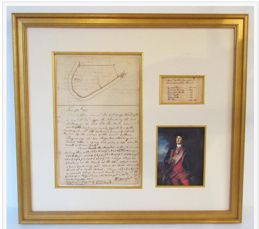
George Washington autographed manuscript with drawing, dated June 20, 1771 (est. $20,000-$25,000).

As with all University Archives online auctions, this one is packed with important, scarce and