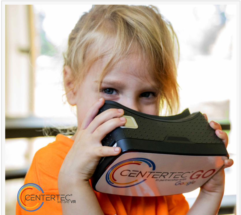
Young Girl uses STEM VR at centertec

Tickets are available online at http://www.centertec.com .