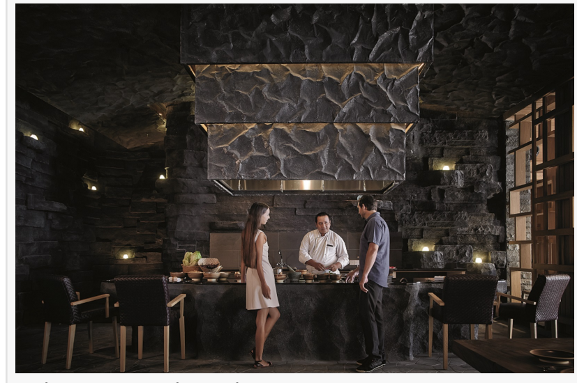
Indonesian cooking class

weddings, while a range of outdoor event venues and extravagant spaces provide the perfect scene for celebratory events and wedding reception in Bali. Well-appointed conference venues, luxurious meeting spaces, customizable residential packages and experienced organizers also entice those looking to create inspired MICE Tourism events in Bali. Whether work, pleasure or romance is on the agenda, The Ritz-Carlton, Bali is the place to make memories that last a lifetime. Follow us on Facebook, Instagram, Twitter, Youtube, LinkedIn.