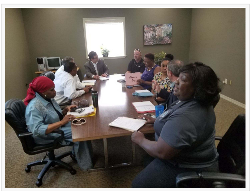
Hattiesburg city officials, The First, A National Banking Association, the National League of Cities, the Greater Hattiesburg Builders Association, the local Team Depot prepare for veteran sites visits

With support from NLC, mayors and city officials are participating in the annual campaign by helping identify older veterans who need home repairs and collaborating with partners throughout the process to ensure veterans in need receive the proper