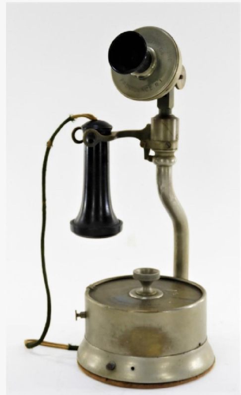
Circa 1893 Clark "candlestick" telephone, 15.5 inches tall, patented May 30, 1893 ($3,000).