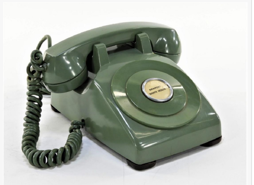
Telephone from President Dwight Eisenhower's Newport (R.I.) summer White House residence ($1,375).