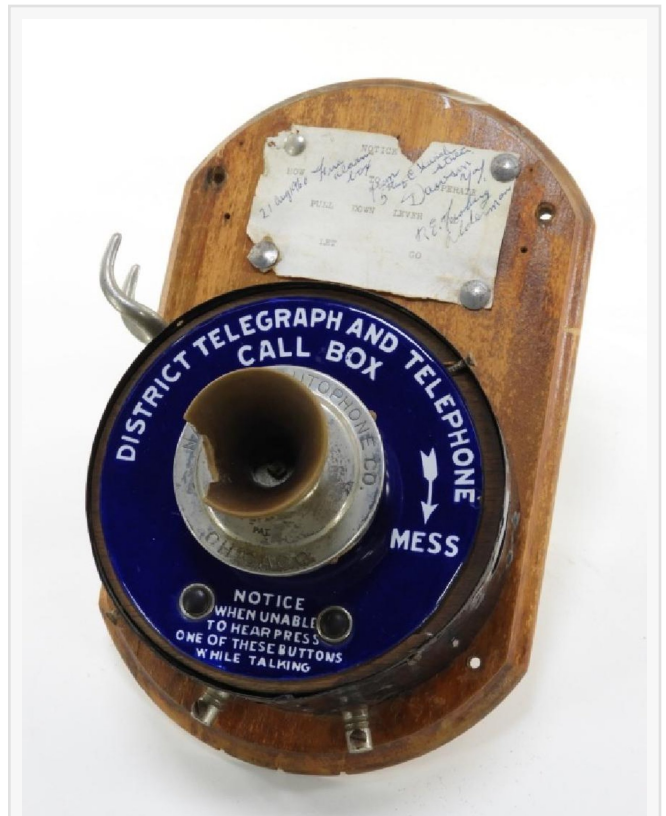
The first phone/emergency call box ever installed in the Yukon Territory in Canada, circa 1900 ($2,500).

Travis Landry Bruneau & Co. Auctioneers 4015339980 email us here