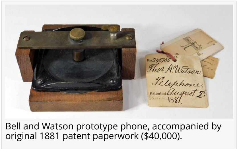
Bell and Watson prototype phone, accompanied by original 1881 patent paperwork ($40,000).

CRANSTON, R.I., UNITED STATES, August 8, 2018 /EINPresswire.com/ -- CRANSTON, R.I. – An original model of Alexander Graham Bell and Thomas A. Watson 's very first telephone from 1881 sold for $40,000 and a rare circa 1876 Bell Butter Stamp magneto telephone originally installed at a residence in Newport, Rhode Island in 1891 brought $27,500 at an historical telephone auction held August 4th by Bruneau & Co. Auctioneers in Cranston.