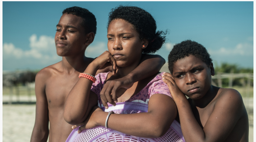
BLACK MEXICANS (La Negrada) screening at ADIFF DC on Saturday, August 18 @ 3:40pm