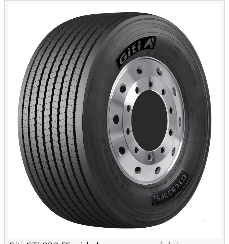
Giti GTL933 FS wide base commercial tire

The tire manufacturer provides original equipment commercial truck tires to more than 300 models of trucks and buses worldwide and has successful commercial dealer networks across the globe.