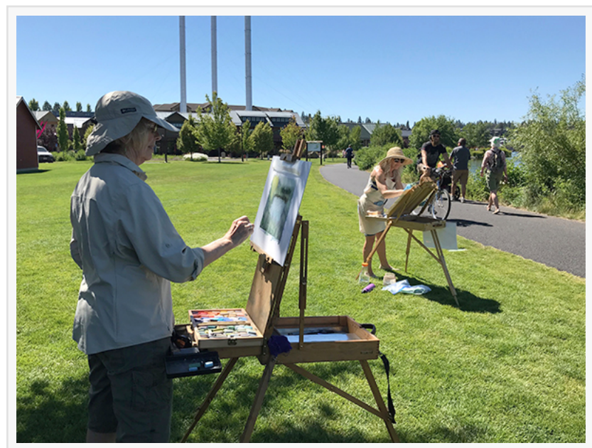
Artists in Action plein air art creation in Bend, Oregon.