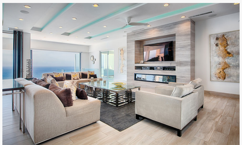
Living Room - Villa Lands End in Cabo San Lucas, Mexico