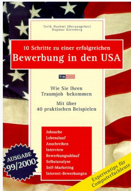
Prior book of Terik Hashmi on successful job application, published by TIA Publishers

Secure | https://terikhashmi.blogspot.com/2018/07/normal-0-false-false-false-en-us-x-none_64.html